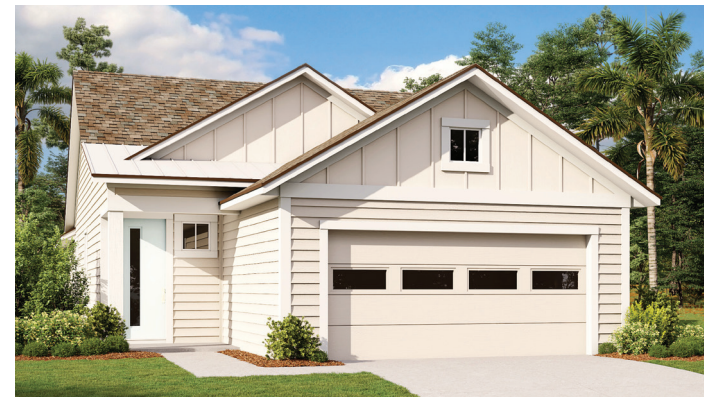
MODERN FARMHOUSE ELEVATION #1