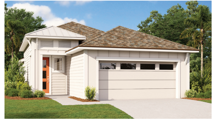
MODERN COASTAL ELEVATION #5

3 BEDROOMS, 2 BATHS AND 2-CAR GARAGE LIVING AREA: 1,690 SQ. FT.