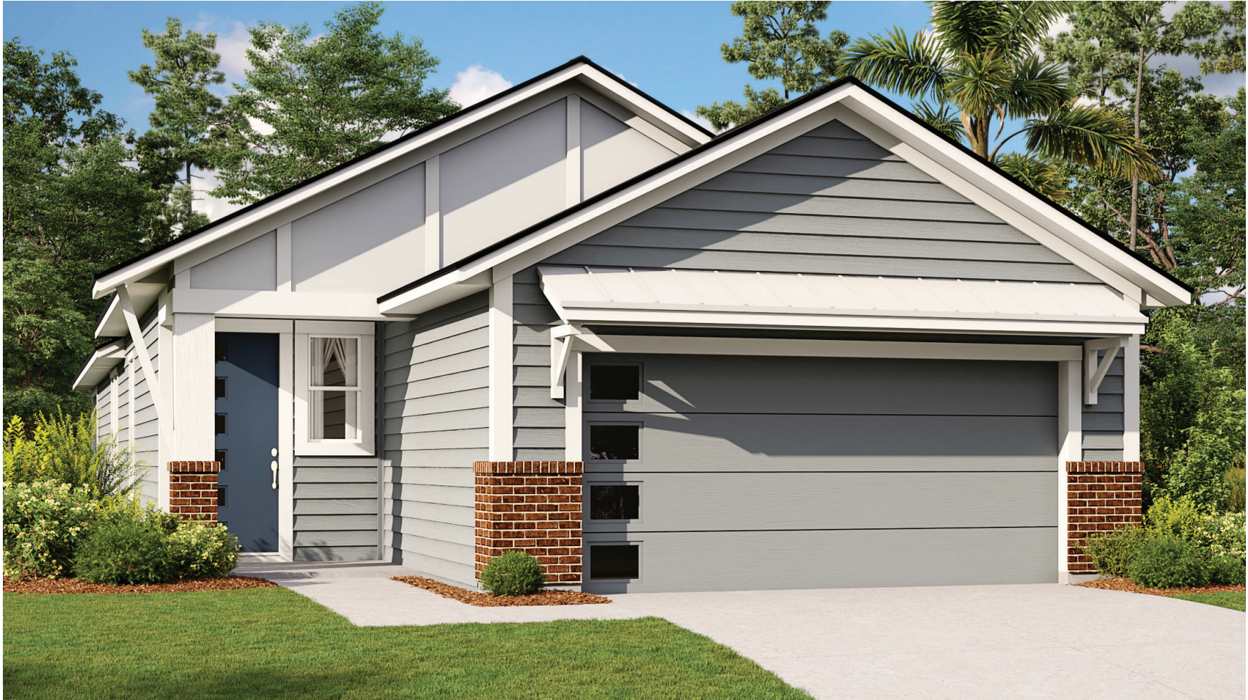
MODERN ELECTIC ELEVATION #7