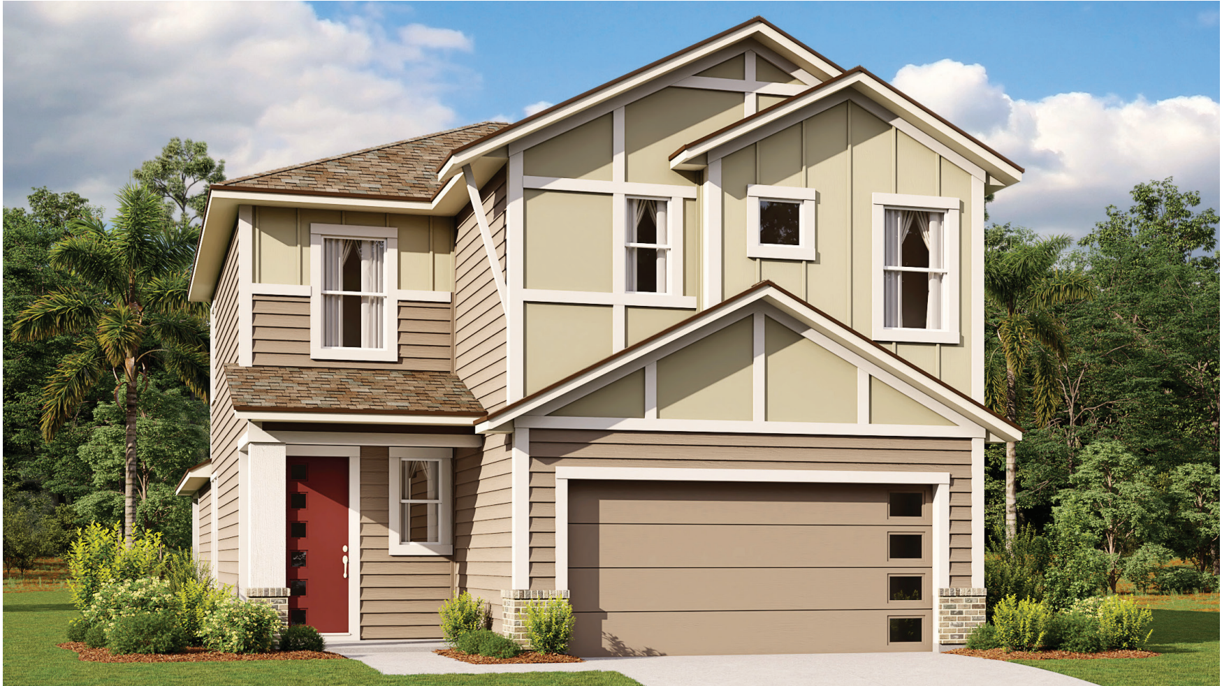
MODERN ECLECTIC ELEVATION #2