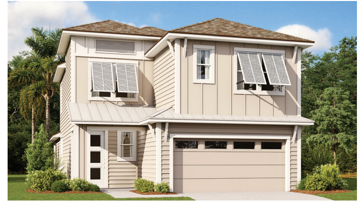
MODERN COASTAL ELEVATION #4

4 BEDROOMS, 2 ½ BATHS, LOFT AND 2-CAR GARAGE LIVING AREA: 2,398 SQ. FT.