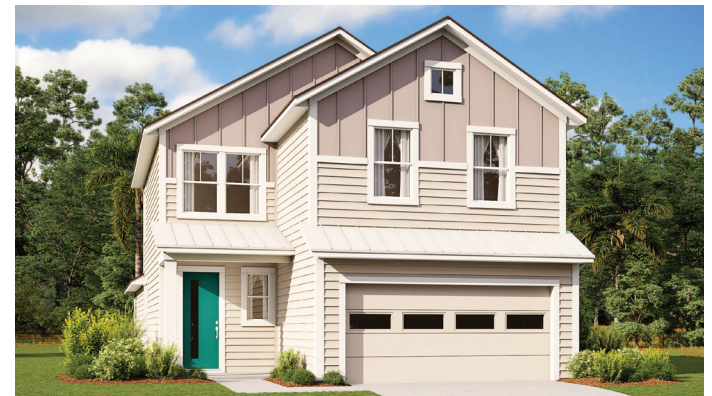
MODERN FARMHOUSE ELEVATION #3