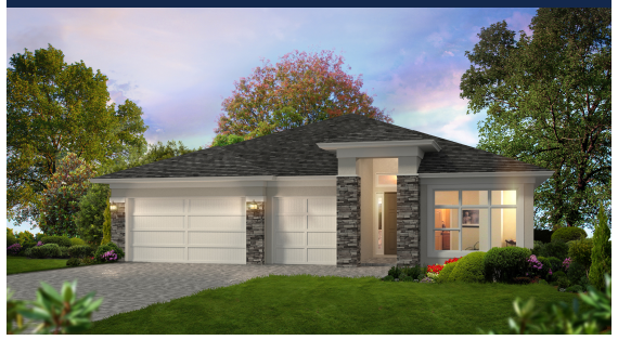
THE WEST INDIES (STUCCO)